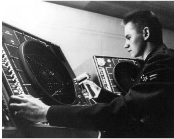
FIGURE 1.1 . SAGE Operator Seeing Through the Air

While radar enables stand-off tracking of airborne objects, sonar (sound navigation and ranging) was invented to provide an ability to see through water to detect and locate submerged objects. Additional invention enabled humans to see non visible spectra, infrared, providing an ability to see through the dark.